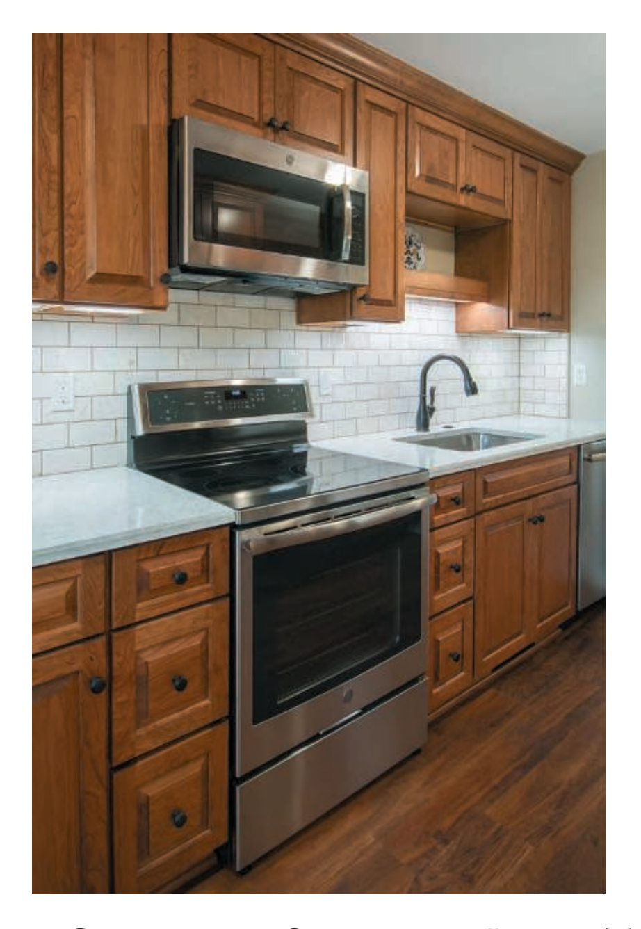
SAME QUALITY SHORTER LEAD TIME