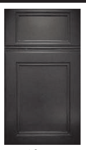
Thames One Piece MDF

Colors will vary slightly from this printed brochure. Please request a sample to see actual color.